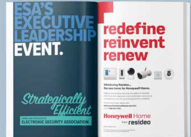
Full Page Ad in Summit Guide