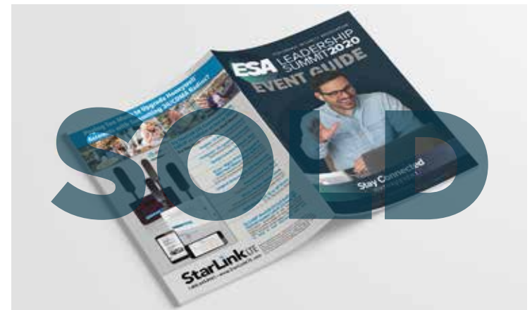
Summit Guide Sponsor

Includes logo on the cover and a full page back cover ad