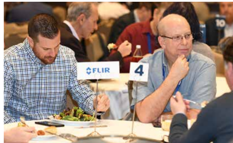
Table Sponsorship at Tuesday, Wednesday, and Thursday Luncheons

Each lunch will have different attendees assigned to your table. Sponsors will have the opportunity to provide a list of preferred attendees and ESA will work to assign as many as possible.